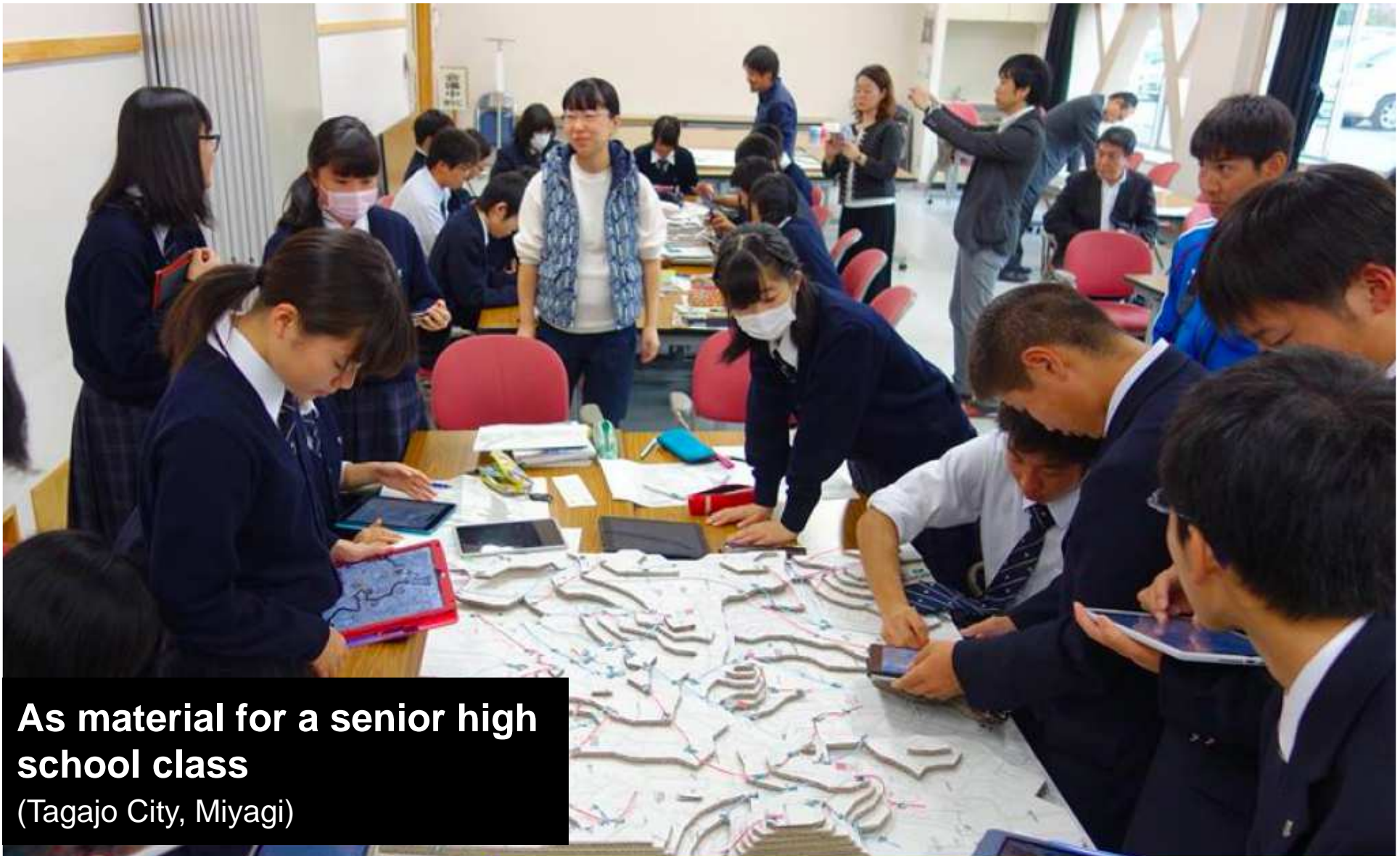
As material for a senior high school class (Tagajo City, Miyagi)

Learnt about ridges and valleys, and thought about the risk of sediment disaster